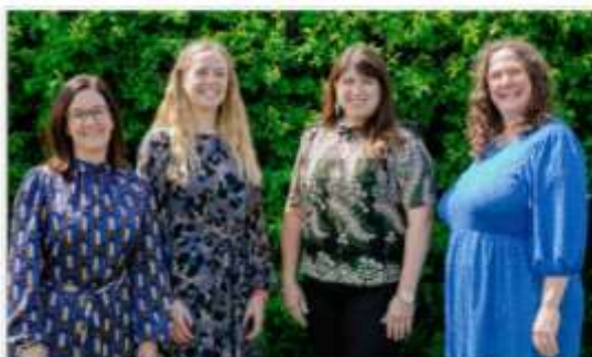
Senior Leadership Team