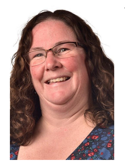
Deputy Headteacher/Key Stage 1 and EYFS Lead